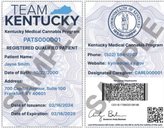
Registered Qualified Patient Card