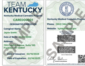
Designated Caregiver Card