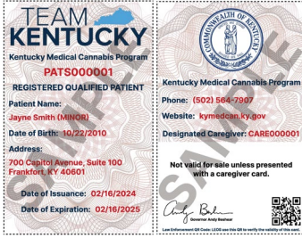
Registered Qualified Minor Patient Card