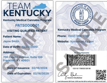
Visiting Registered Qualified Patient Card