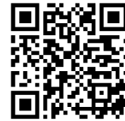
Sample QR Code (Example Only)